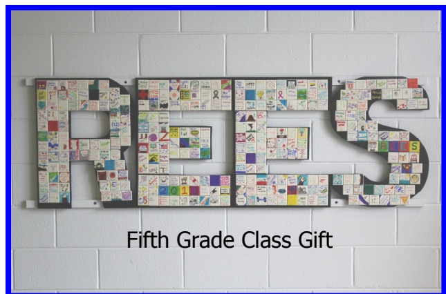
Fifth Grade Class Gift