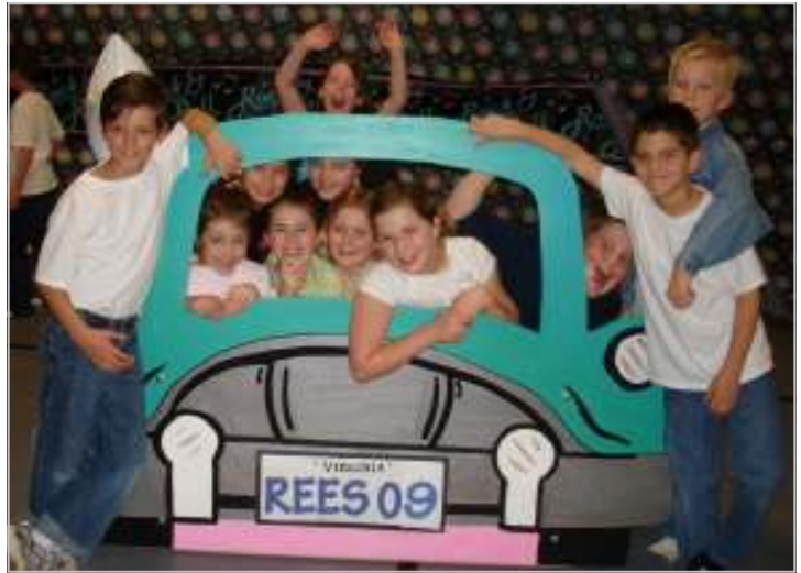
Fun at the Sock Hop!