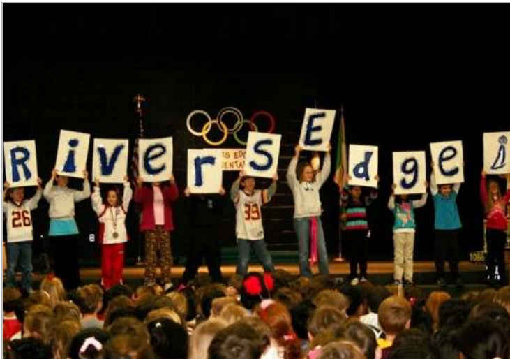
Rally at the River